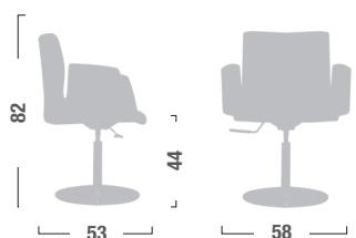
VT12 Poltroncina girevole, base a calice. Globed base revolving chair.