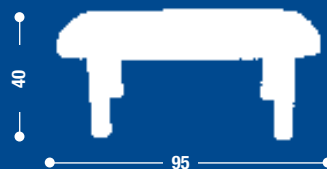
FC16 Tavolino attesa. Waiting table.