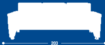
FC13 Divano a 3 posti. Three-seats divan.