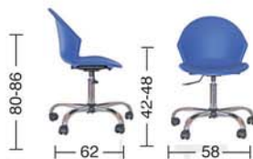
P 28 Sedia girevole Swivel chair