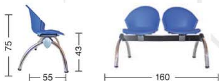
Panca 2 posti Two seat bench