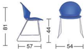
P 24 Sedia sovrapponibile Stackable chair