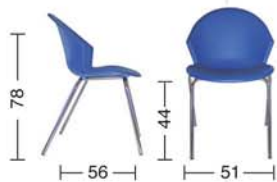
P 20 Sedia sovrapponibile Stackable chair