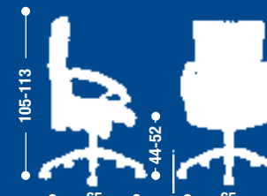
MS43 Poltrona direzionale con braccioli e oscillante mov. 6. Directional armchair with mov. 6 tilting.