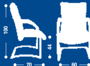
MR58 - MS48 Poltrona attesa fissa con braccioli. Fixed armchair.