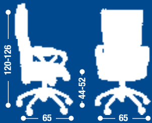
MR51 Poltrona presidenziale con braccioli e oscillante mov. 6. Presidential armchair with mov. 6 tilting.